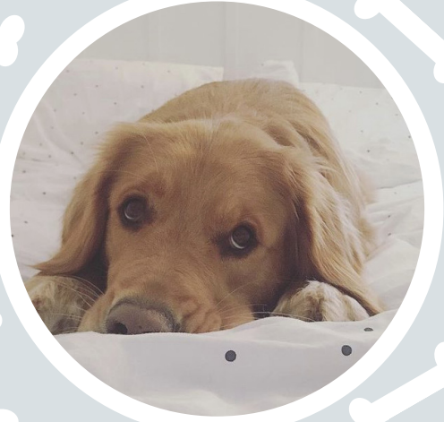
Helen's dog Archie