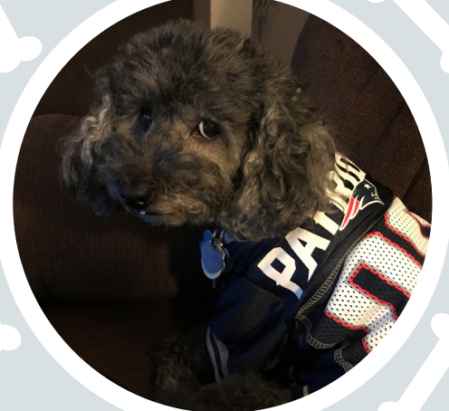
Cat's dog Sadie