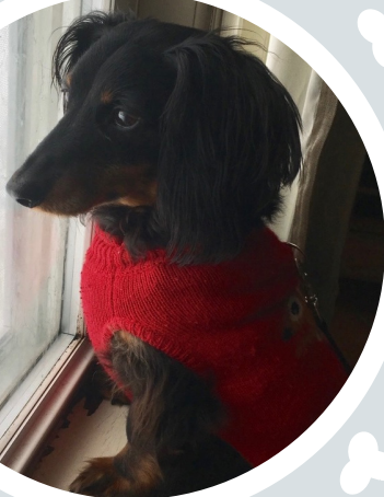
Danny's dog Odie